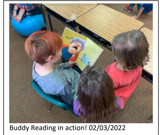
Buddy Reading in action! 02/03/2022

visit https://smartreading.org/about-smart/local-offices/rogue-valley-area/ Funding for SMART reading comes from contributors in Jackson and Josephine counties.