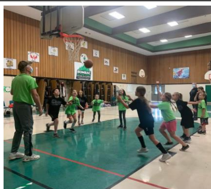
Junior Loggers (Grades 2-4) rush for the rebound. 02/05/2022

The District was also able to complete a District-wide Seismic Assessment of all facilities in the District. That assessment was conducted by ZCS Engineering and Architecture, Inc. The $25,000 cost was funded by a second TAP grant from the State of Oregon.