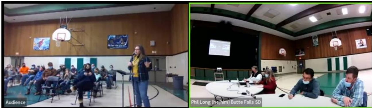
Butte Falls Charter School parents and District patrons speak to the School Board about concerns and hopes for the District as state mandates relax. These past two years have been difficult for families, children and communities. 2/28 2020