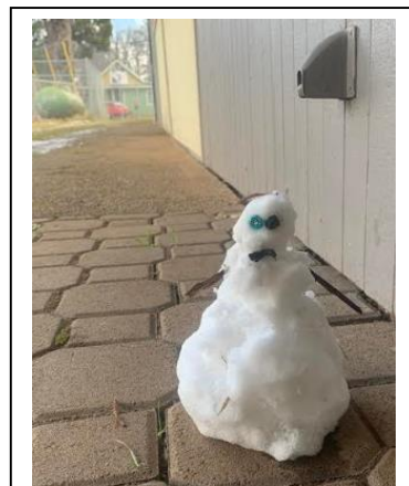
A lonely sentinel welcomes K-7 students to the cafeteria.

Radon Testing Complete: The results are in (and good)! Radon is a naturally-occurring radioactive gas that can cause lung cancer. Radon gas is inert, colorless and odorless. Radon is naturally in the atmosphere in trace amounts. Outdoors, radon disperses rapidly and, generally, is not a health issue. Most radon exposure occurs inside homes, schools and workplaces. Radon gas becomes trapped indoors after it enters buildings through cracks and other holes in the foundation. Indoor radon can be controlled and managed with proven, cost-effective techniques.