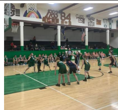
Middle School Loggers ready to leap! 02/03/2022