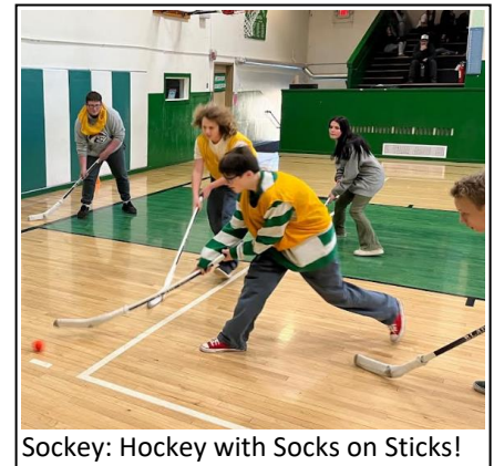
Sockeye: Hockey with Socks on Sticks!