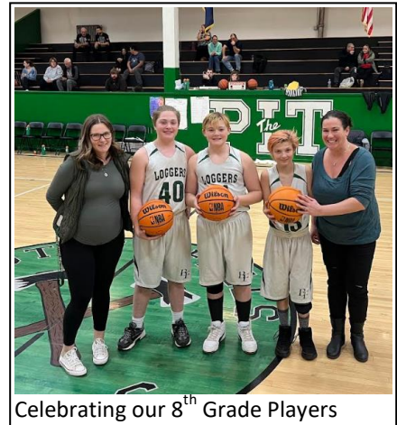
Celebrating our 8 th Grade Players