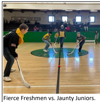
Fierce Freshmen vs. Jaunty Juniors.