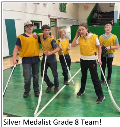
Silver Medalist Grade 8 Team!

Grades 8 through 12 faced off at the December 15 Assembly in a multi-round mini-hockey tournament for class points. The final championship game was hard-fought with the seniors winning 2-1. Here are a few highlight photos.