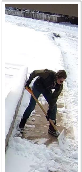
Security Cameras picked-up this versatile employee helping out before school in late-February. Thank you, everyone, who stepped up and helped us keep our school going!

A presentation of the application will be included on the agenda for that Board meeting. The Board will provide time after the presentation for public comment concerning the application. Comment may also be provided electronically after the presentation via Feedback@buttefalls.k12.or.us . The grant