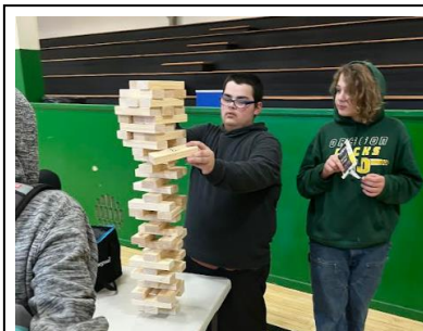
For students not playing in the tournament, we provided other strategic thinking challenges. (It's a pretty tricky balancing act!)