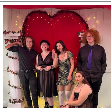
Heartfelt fun for our secondary students at the Valentine's Day Dance on Thursday, February 16. ❤️