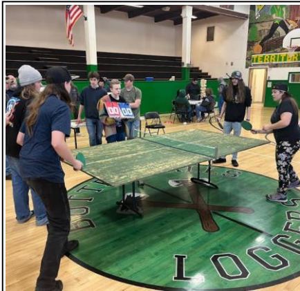
Seniors v. Sophomores: Mercy is a cold dish served sparingly in Table Tennis!