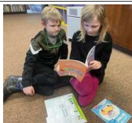
Our weekly SMART Reading program allows older students to read with our youngest students. Sometimes this provides siblings quality reading time together. 3/13/2024