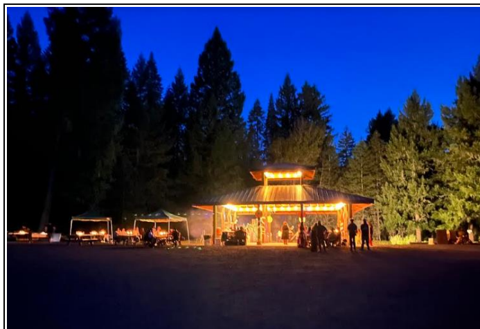
The Pavilion at the NRC was transformed into a Viking longhouse (langhus) for an evening of good fun and feasting.

The Junior Class sponsored this year’s Prom. The theme was Vikings and activities included dancing (of course) but also a Viking battle zone where participants could compete in axe-throwing and hand-to-hand combat. (Oh, yes, there was also a volleyball game in the former fish pond. Not very Viking-like, but a lot of fun!)