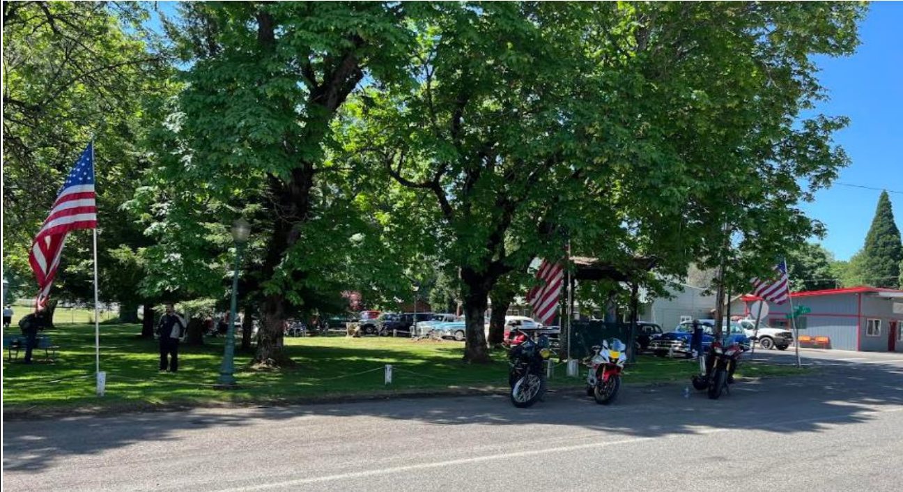
We have much to be thankful as we remember those who have served and sacrificed for our freedoms!