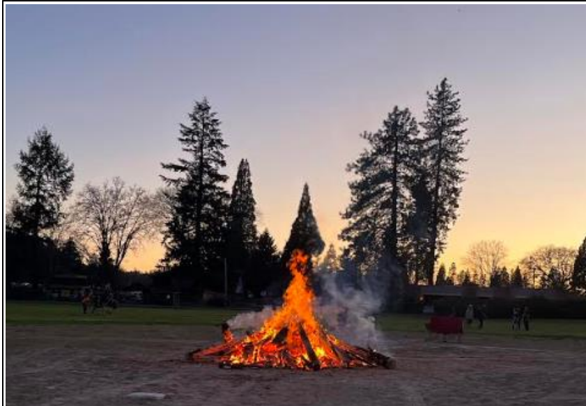
A well-built bonfire anticipates sunset and the warmth of friends and family gathered around the coals.