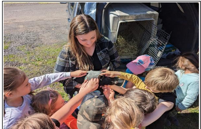
A guest pig hogs the attention of first graders during its surprise visit to Butte Falls Charter School Elementary Campus.