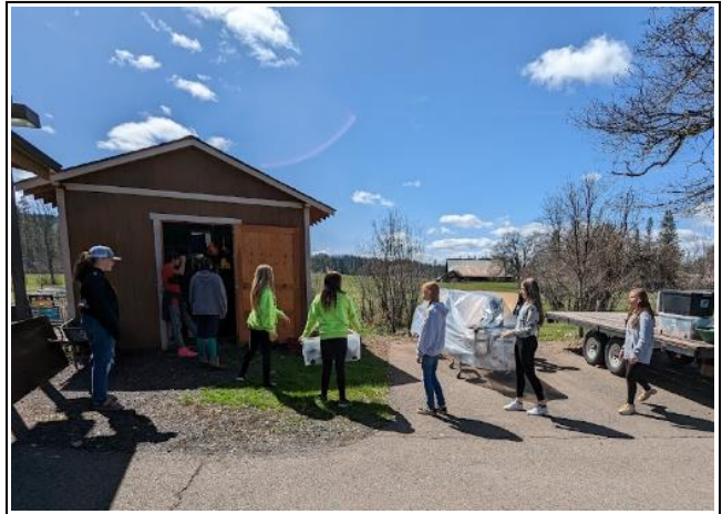
The Landing provides many services for our community. Here students are helping organize resources at the Landing.