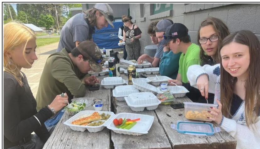
Seniors Enjoy the lunch break. Free breakfast and lunch are available on campus every day to every student. Food always tastes better when friends are included.