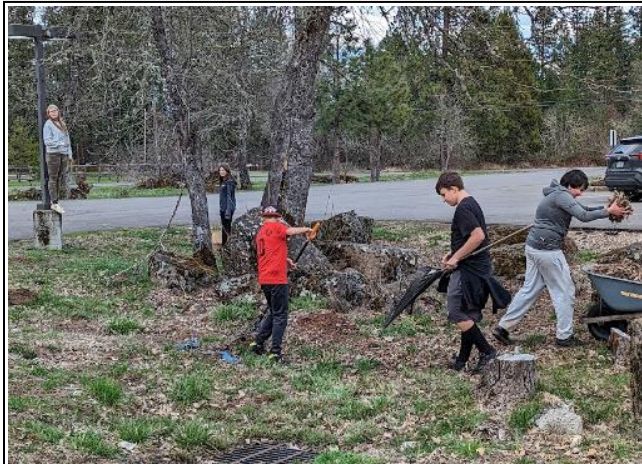
Helping usually involves work. Kudos to these students for tackling a big job to tidy up the grounds at The Landing.