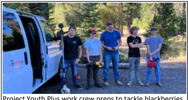
Project Youth Plus work crew preps to tackle blackberries.