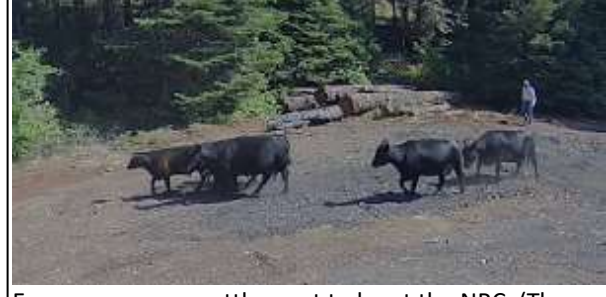
Even open range cattle want to be at the NRC. (They were kindly escorted off the grounds.)