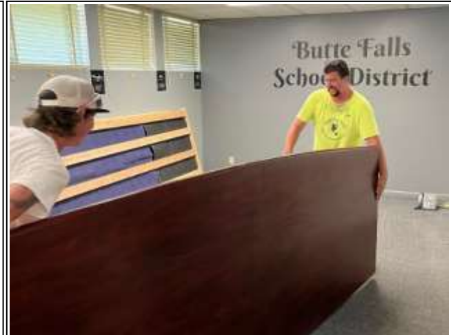
A new-to-us Board Room table (glass top still in crate).