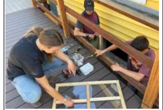
Incoming 9th graders spend a day building and installing basement windows. 7/26/23

This summer we have had some help from work crews associated with Project Youth Plus as well as some of our own students. Here are a few glimpses.