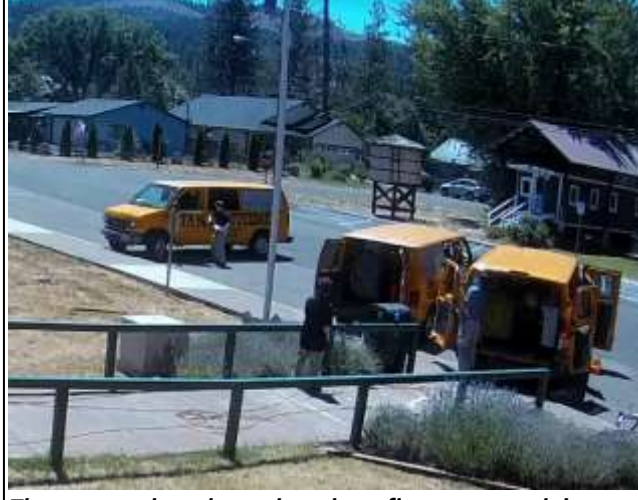
They came, they cleaned, and our floors are ready!

We have several temporary summer employees who are helping us paint classrooms, doors and other spaces that need refreshing. At the high school campus this includes the Health/Electives classroom and the English/Language Arts classroom. With the help of <u>Global Pacific Environmental</u>, <u>Inc.</u>, we have removed the carpeting and underlying asbestos tiles in the English classroom and will be working with <u>Fashion Floors</u> to install new carpet squares.