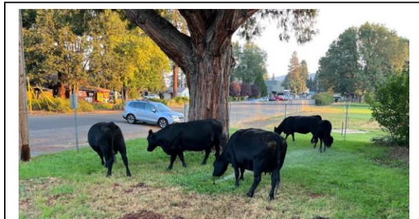
Open range cows showed up for school one week early. No, we didn't enroll them, but we are saving a spot for any student who wants to come and learn and be a part of our terrific school community!

Online Registration is open and our classes still have room for students. Classes begin on Tuesday, September 5. If you have a student to enroll, please contact our school office at 541-865-3563 or email techsupport@buttefalls.k12.or.us . Our on-line registration process is available at our website ( www.buttefalls.k12.or.us ). You may also come directly to our school to enroll. Once we reach our target enrollment for a grade, we place additional students on a waiting list. At this point our average class sizes are generally landing between 10 and 16 with a few exceptions slightly higher or lower.