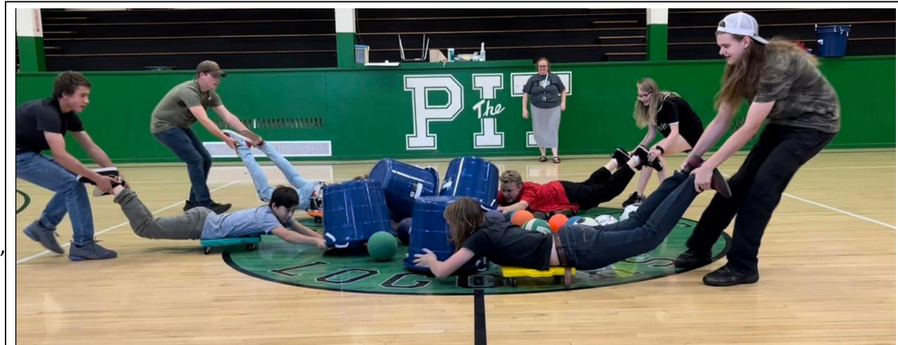
A Hippo feeding frenzy!

Hungry Hippos. Each grade (8-12) formed a team and selected two people to be the hungry hippo. Hippo food (in the form of a variety of balls) was piled in the middle of the gym and when the dinner bell rang, hippos converged on the food and tried to gather the most for their team.