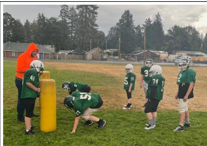
Skill building: Learning the stance!

We did a lot of learning together in September and we had some fun, too. Our first week at both campuses focused on how to be successful at school. Our students learned the how the daily schedule flows, procedures that make classroom time, meal time, and breaks (recesses) work well as well as how to navigate our campuses. We got our Middle School Sports program underway. This fall we have Football and Volleyball.