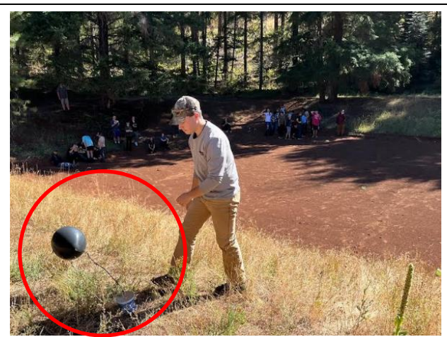
As teams watch in the distance, a team member scrambles to collect the fallen egg. The verdict? Intact! And we have yet another a winner! (No yolk!)