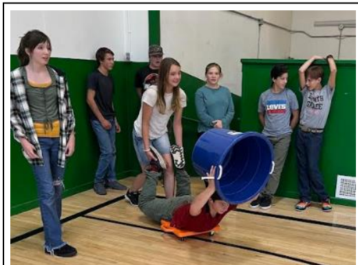
Everyone became more ferocious in round 2!