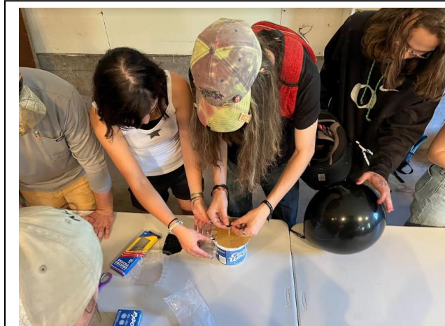
Will this egg protector work? This team works feverishly to hatch their plan before time runs out!