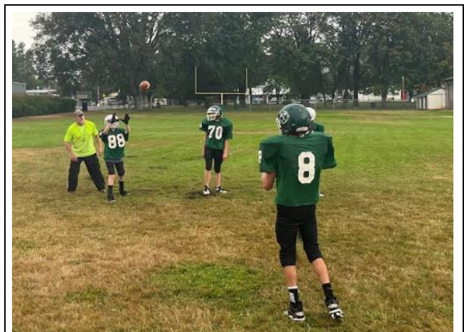
Skill building: Learning effective receiving technique!