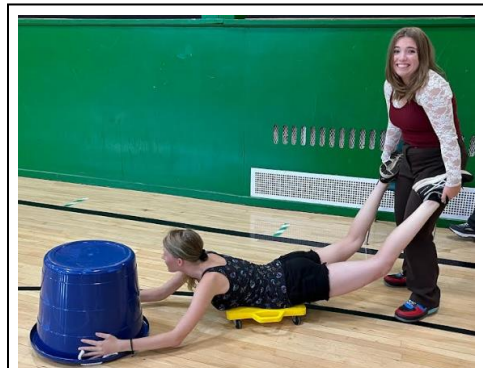
Sophomores are ready to roll again!