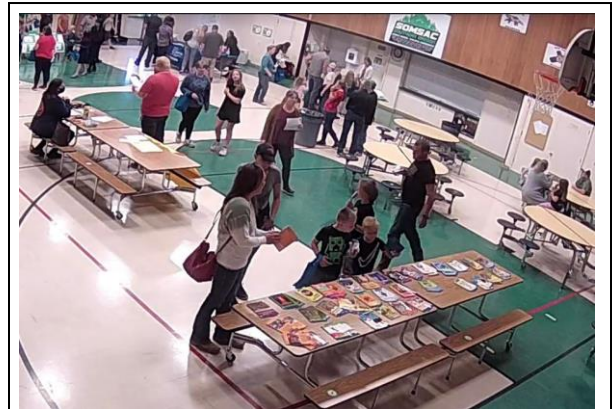
Open House featured student art work, information from community partners and ice cream bars for all.

We were happy to have informational presentations hosted by community partners like Rogue Community Health, Project Youth+, Butte Falls Natural Resource Center, and Butte Falls Community Church (the Good News Club) as parents have expressed interest in having more information about our community resources for families.