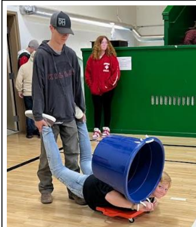
Hippo on the hunt!