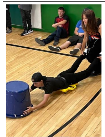
Is this hippo hangry!