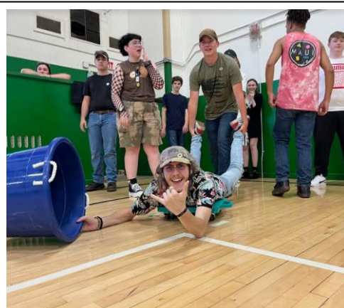
"Right on" is what the Seniors were as they became repeat champions.