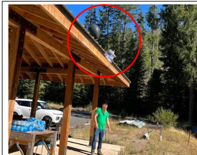
The Humpty-Dumpty moment of truth! Mr. Dufrense monitors the drop! Not an egg-zact science, but fun!