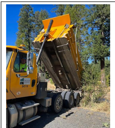
Partners make all the difference!

We recently obtained four loads of fill dirt from the Jackson County Roads crew to help finish the bioswale project by our large parking lot. This student-constructed drainage field will capture any polluted storm water runoff from the parking area near the NRC Pavilion and filter the pollution before returning the water to Ginger Creek.