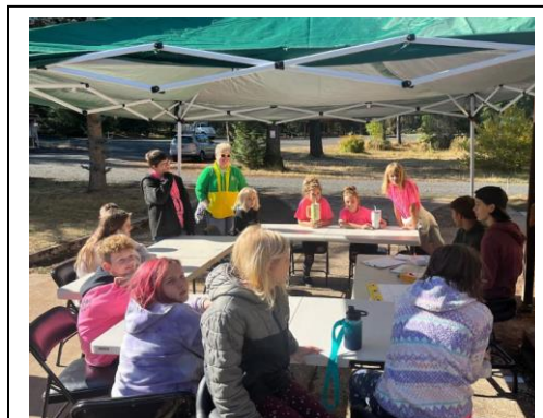
Two ninth-grade students lead an activity with 6 th Graders