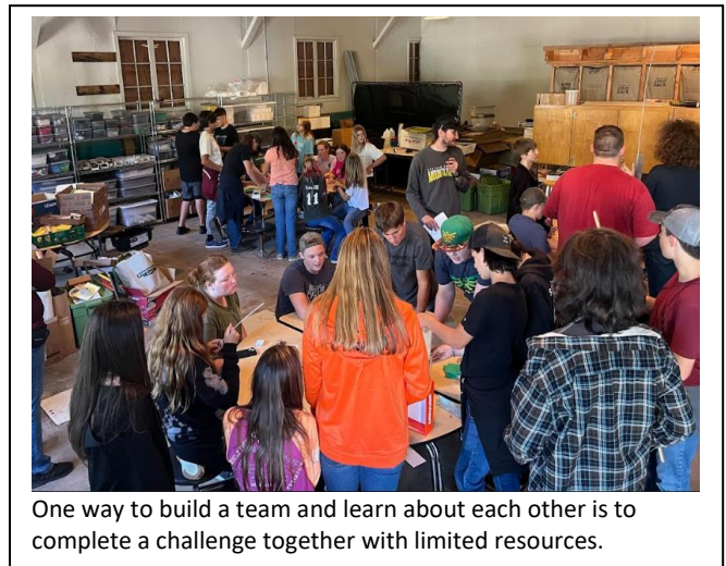
One way to build a team and learn about each other is to complete a challenge together with limited resources.