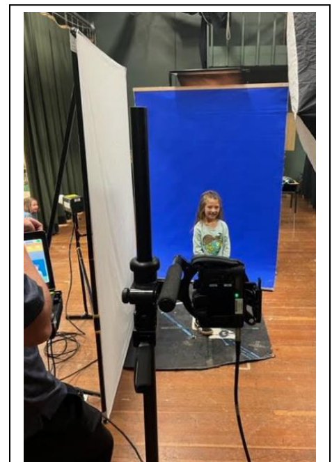
School Picture Day: Lookin' good!

We were thankful to have Lifetouch photographers take school pictures on September 21. They will return for picture makeups sometime in October (TBA).