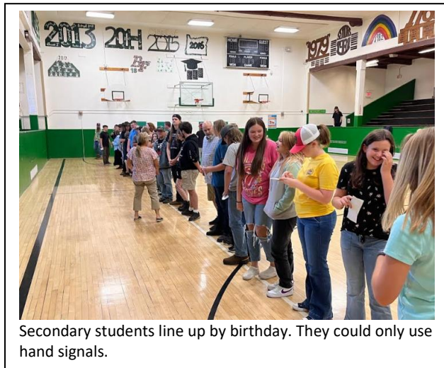
Secondary students line up by birthday. They could only use hand signals.

At the high school we spent the last two hours of each day with special lessons on strengthening interpersonal skills to help us get along with each other. Some of these lessons were in small groups but others involved the whole school in team-building and problem-solving challenges and games.