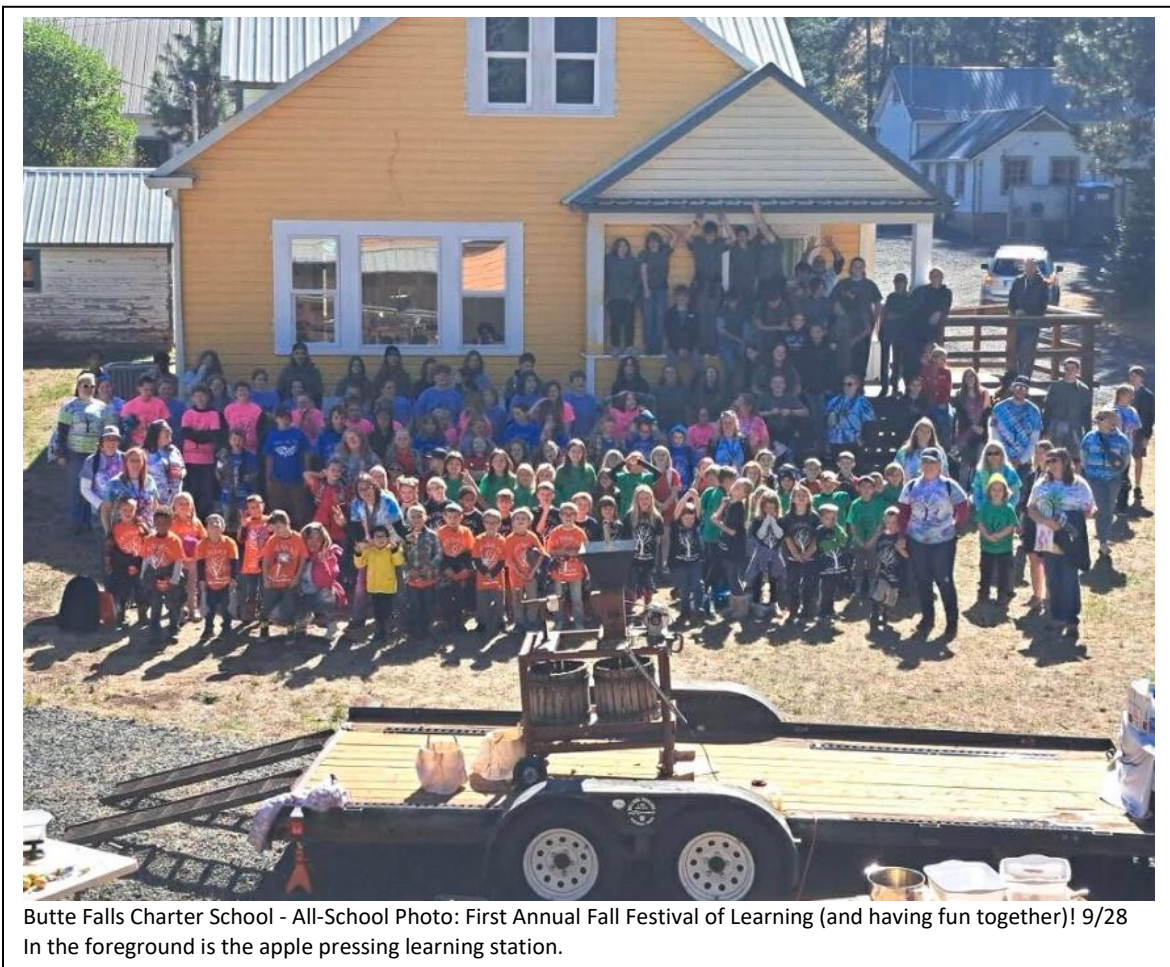
Butte Falls Charter School - All-School Photo: First Annual Fall Festival of Learning (and having fun together)! 9/28 In the foreground is the apple pressing learning station.

The weather was perfect. We all enjoyed sack lunches together! It was the best of Butte Falls Charter School learning!