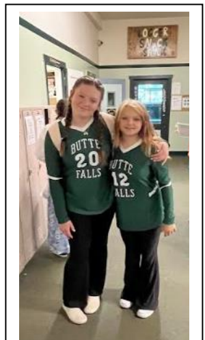
A new school year brings new friends.