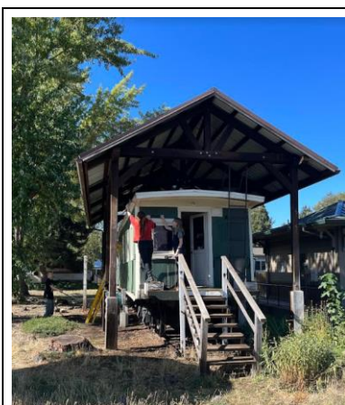
Teamwork makes things go faster!