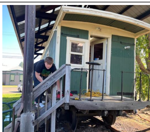
Stair repair and surface sanding.