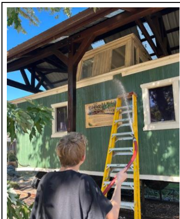
Washing the exterior.

The Caboose Museum is parked across the street from the high school, adjacent to the Butte Falls branch of the Jackson County Library System. It testifies to Butte Falls past history as a logging town with a railway that ran down to the Valley Floor. Learning about and preserving artifacts from our past helps us understand our heritage and how our community has grown and changed. Kudos to our Juniors for taking on this community service project!