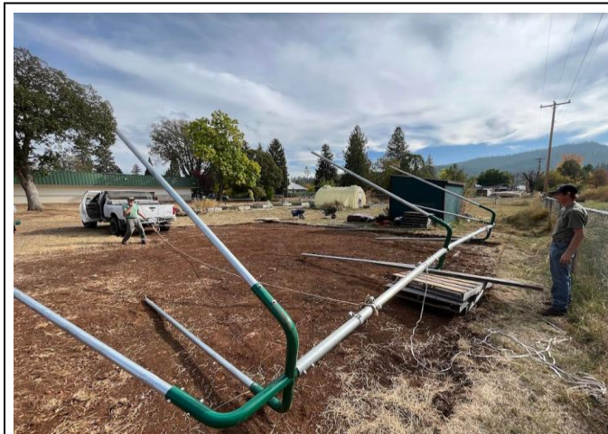
Our new swing set will soon be ready for use!

This past week Keith and Ron Tilley helped put together our new primary swing set. It is now set in concrete footings. We will be ordering new playground soft fall materials for the swing set, the play structure and our other swing set. Once that is installed, we can install the swings, adjust them for use by our younger students (K-Grade 3), and allow students to use them. This swing set and the soft fall material were purchased through grant funds provided by AllCare Health from its Community Resiliency Fund.