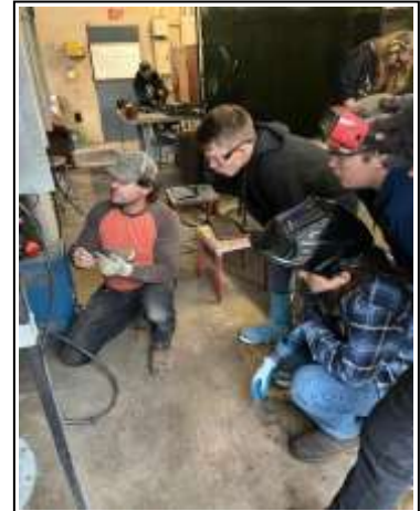
Students scrutinize equipment used in a welding booth. 11/14/23

Before the end of the quarter, the students will know the basic welding and fabrication procedures used in the manufacturing process. They will develop skills in bench work, welding applications, and shop safety. Students are exposed to oxy-fuel welding, shielded metal arc welding, gas metal arc welding, and oxy-fuel cutting. They will also be introduced to our computer-directed plasma cutter and complete several projects demonstrating skills essential for planning and precision manufacturing.