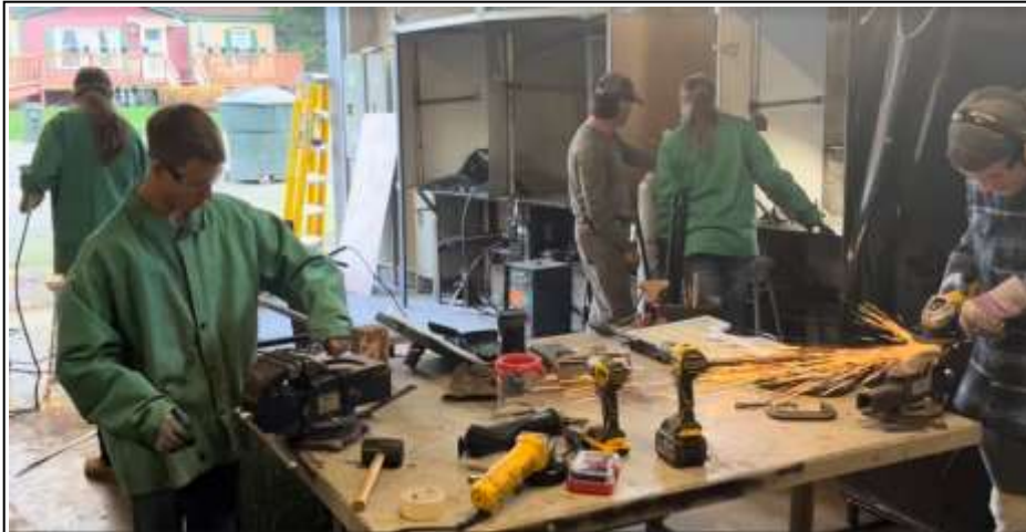
Self-discipline and awareness of the surrounding work environment are key skills that allow for a safe and productive work environment. 11/16/23